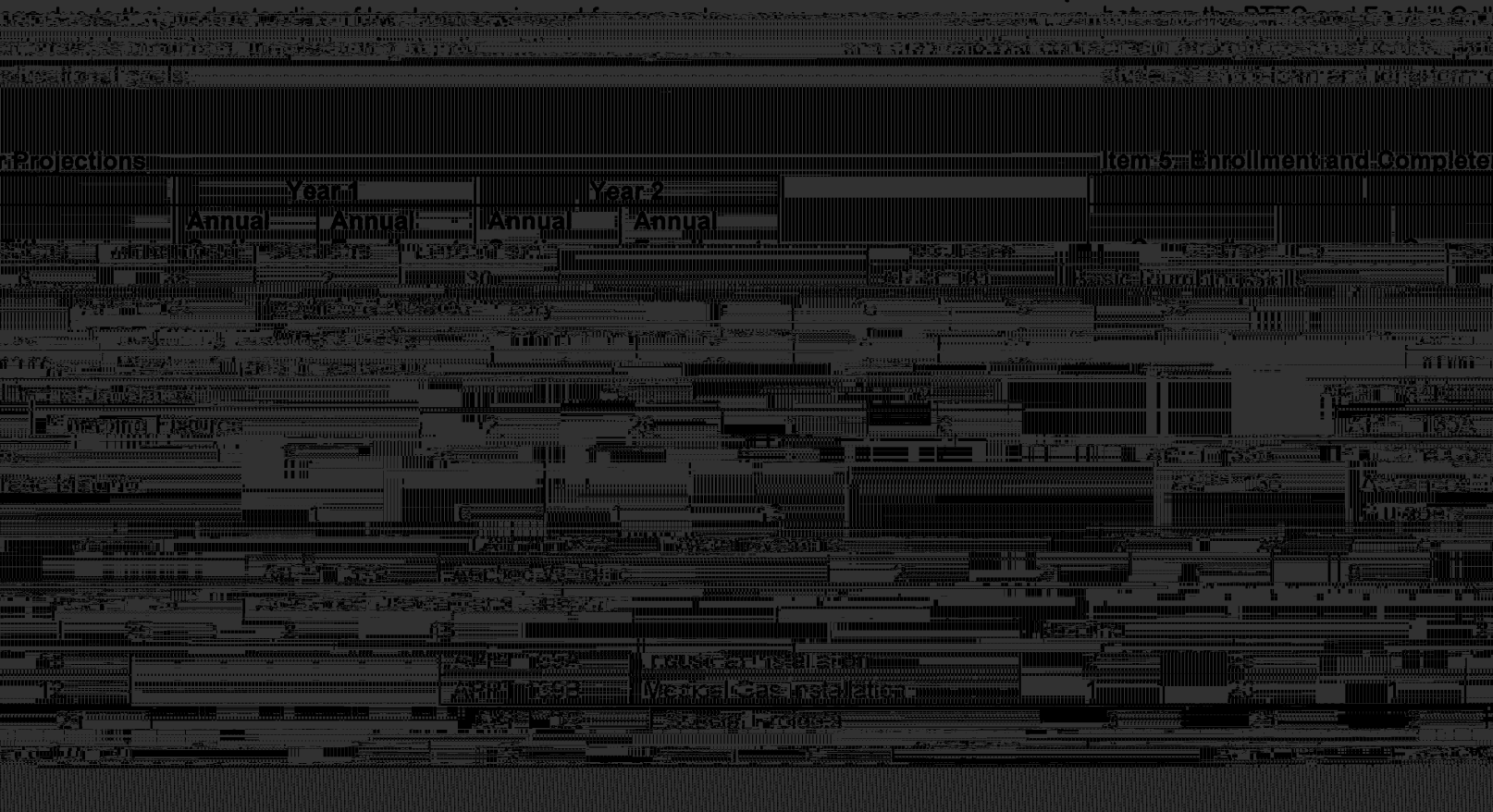
Item 6. Place of Program in Curriculum/Similar Programs