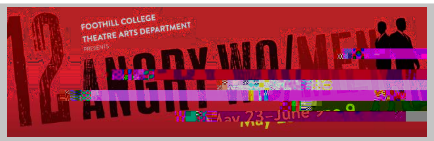
Get your tickets for the Theatre Arts Department production of 12 Angry Wo/men!